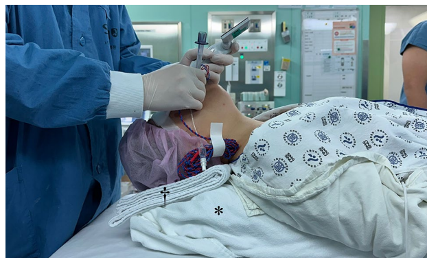
Figure 1. Prior to tracheal intubation, a standardized pillow (*) was placed beneath the head and back of the patient for the thyroid surgical position to prevent tube displacement, which is possible if the patient's position should be adjusted to a thyroid surgical position after tracheal intubation without pre-positioning. If needed to prevent unnecessary hyperextension of patient neck, the thin clean towel (†) was applied. Permission was obtained from the patient.

After positioning, the glottic views of the patient were evaluated using a video laryngoscope (McGRATH™ MAC, Aircraft Medical Ltd., Edinburgh, UK) with a disposable Macintosh type blade. The blade size was suited for patients (size 3 for females and 4 for males, usually). First, assuming that direct laryngoscopy was performed without seeing the monitor screen of the video laryngoscope, the glottic view was evaluated using the modified Cormack–Lehane (C–L) grade and percentage of glottic opening (POGO) scale without external laryngeal